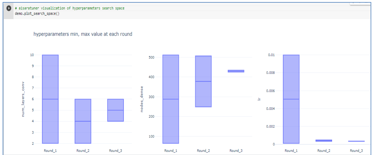
Fig. 3: Graphical visualization of aisasartuner search space

AiSara Keras tuner has excellent graphical visualization methods which can explain the search space. Few samples of visualizations provided by AiSara keras tuner shown below in Fig.3.